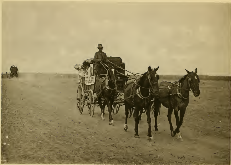
ON THE WAY TO THE GROUNDS.